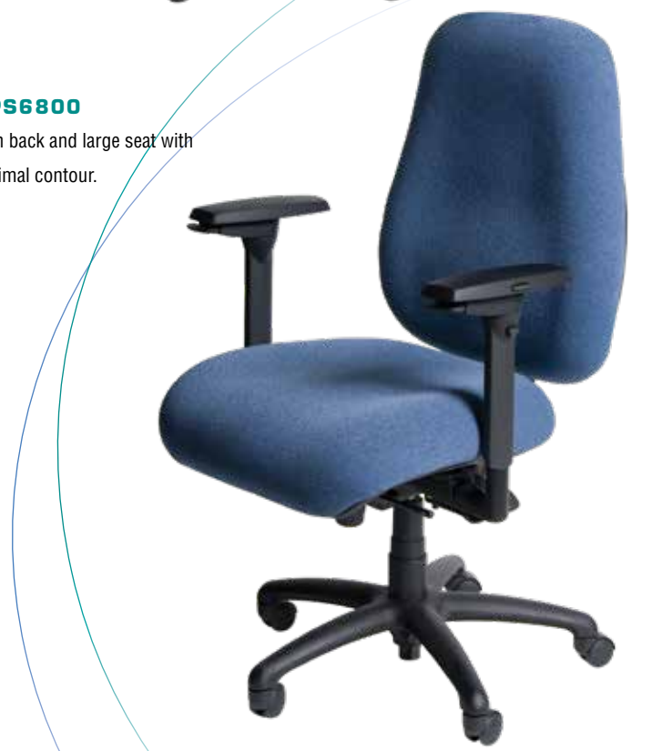
NPS6800 High back and large seat with minimal contour.

The longer you sit, the more important the fit. You'll find that our Neutral Posture® seating can physically match your body size and shape, and support you properly.