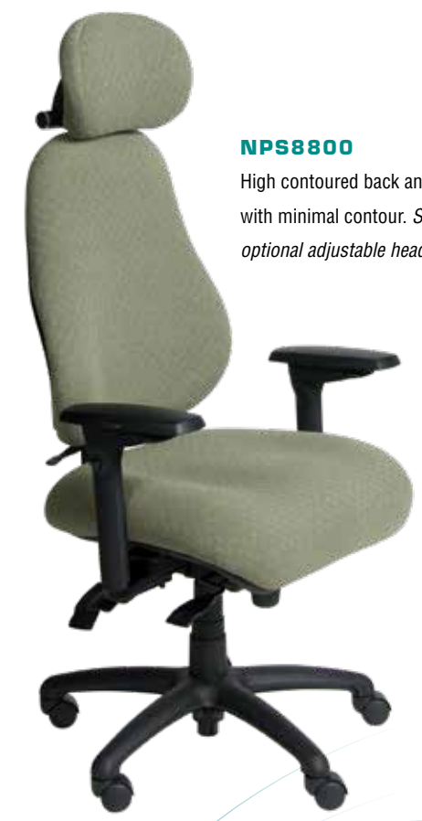
NPS8800 High contoured back and large seat with minimal contour. Shown with optional adjustable headrest.

Neutral Posture® Seating People come in all different shapes and sizes. As anyone knows, one size does not fit all. Correctional Industries offers Neutral Posture® seating that can be configured to fit your exact needs.