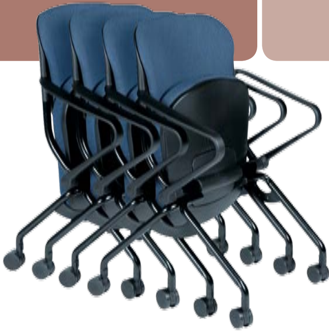
Navigator Chairs (Shown Nested)

To increase efficiency, the new office building was designed so that the two agencies could share some areas that aren't in continual use. Shared areas of the building include the waiting area at the building's main entrance, a kitchen and dining area, and a conference room.