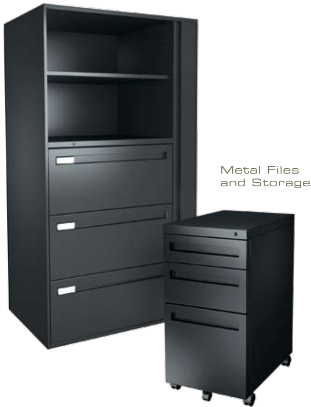
Metal Files and Storage

Durable metal storage cabinets feature plenty of shelf space, full extension drawer glides and folder bars to accommodate letter or legal files.