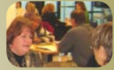
Highlights from mock interviews held at the Washington Corrections Center for Women