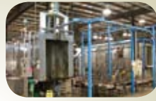
New overspray recovery process implemented at Stafford Creek