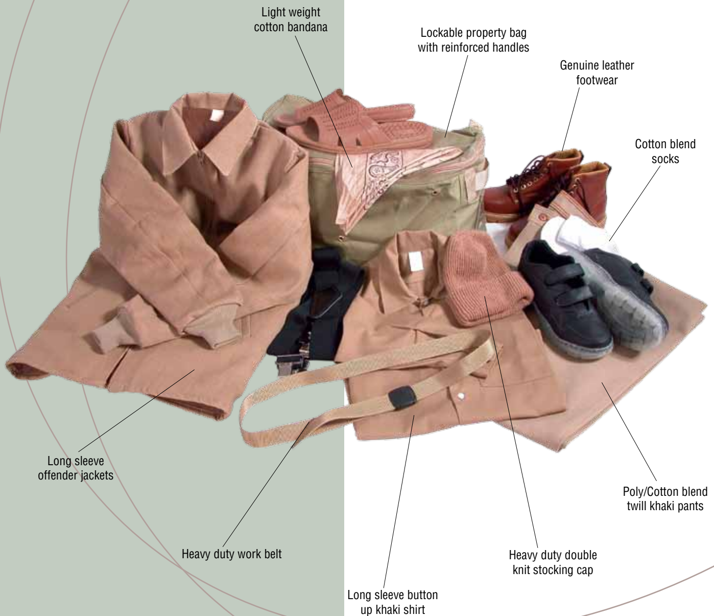
Light weight cotton bandana